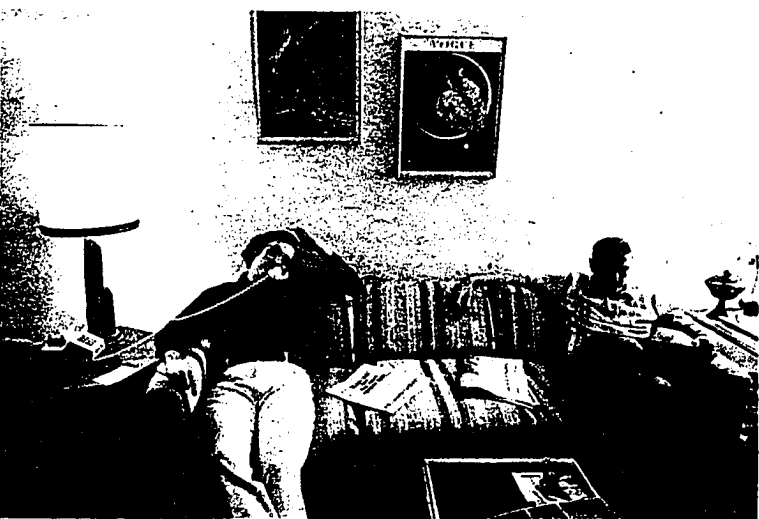
The trader at home with his father. "He drives an old, inexpensive car . . . he dresses in cheap knits; his money tends to pile up, unused."