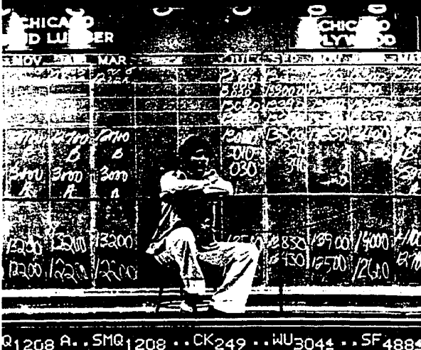
Q1208 A. . SMQ1208 . . CK249 . . WU3044 . . SF4884

Keeping score: Electronic boards post rapid price changes; so do men with chalk, in case the electronic system fails.